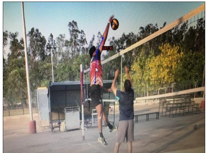
Fig 1: The angle of Shoulder joint at time of short spiking through “Quintic coaching v-17 software.”