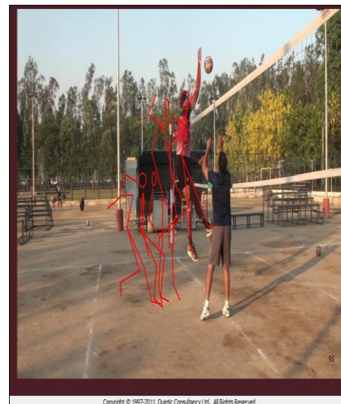
Fig 3: Stick figure analysis of a short spike technique through “Quintic coaching v-17 software.”

The simplest drawing of a human being, one where the torso, arms and legs are just lines while the head is a circle. It’s the greatest creation of humankind which helps to understand the different body segments during very movements. A fundamental challenge that arises during analysis to visual sequences is the problem of describing the motion of non-rigid objects. The ordinary approach while dealing with human motion is to fit the data with an articulated kinematic model, or “stick-figure”, composed of a number of rigid parts connected by flexible joints. The structure of a stick-figure the shape of each body part or “stick” and the connectivity between them remains fixed across time, while motion is encoded as a sequence of pose parameters the joint angles between connected sticks permitted to vary at each time step. The joint angles derived from a stick-figure provide a more-parsimonious representation of the data, suitable for higher level modelling of human motions. For example, stick-figure models are used to convert feature positions obtained from optical motion-capture to joint angles, which can be used to animate computer generated characters.