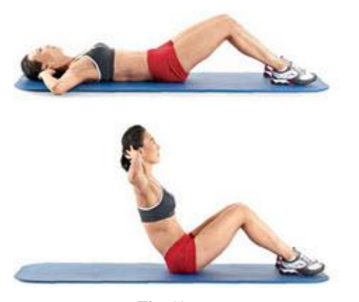
Fig: Sit Ups

Classic sit ups are one of the best ab workouts for 6 pack without equipment. Sit ups help in strengthening the core muscles to increase flexibility and stabilize the balance of the body. It helps in toning the abdominal muscles, lower back, hips, pelvis, chest, arms and shoulders. It helps in reducing back pains, chances of spasms, muscle injury and maintaining better posture.