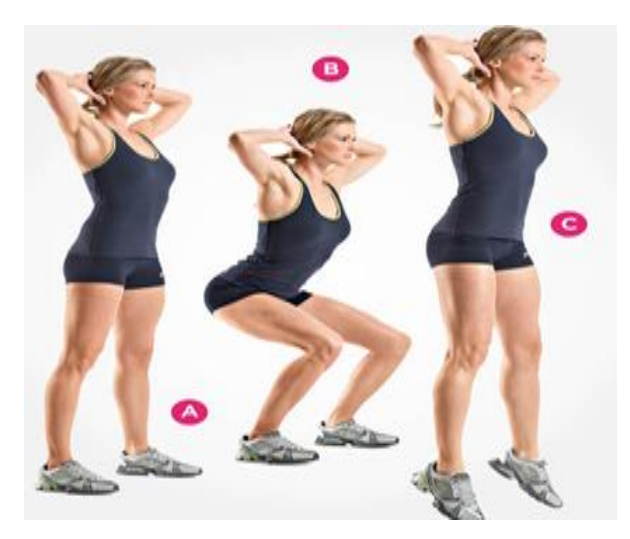
Fig: Sit Ups

Stand straight with your feet a little more than shoulder's width apart, put your hands behind your head with elbows pointing out, keep your back straight and chest out, lower your body till your thighs are parallel to the floor, hold the position for 5 seconds and push up to the straight position. Repeat this 30 times at a stretch.